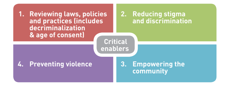
Fig. 5.1 Critical enablers for key populations

This chapter outlines a range of barriers that compromise access to appropriate and good-quality HIV services for key populations, identifies critical enablers to overcome these barriers (as illustrated in Fig. 5.1) and makes a number of good-practice recommendations. These good practice recommendations are based on earlier WHO documents addressing key populations. While these barriers and enablers are interrelated, we attempt to discuss each individually.